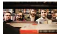
CADILLAC SKY Stubb's Feb. 18

FOR MORE INFORMATION ABOUT THESE AND OTHER SHOWS, SEE PAGE 147.