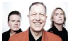
REV. HORTON HEAT Antone's Feb. 12