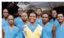
LADYSMITH BLACK MAMBAZO One World Feb. 3