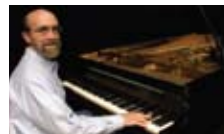
GEORGE WINSTON One World Feb. 13-15